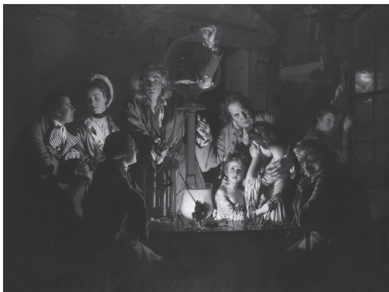
Figure 1.1 An Experiment on a Bird in the Air Pump by Joseph Wright, 1768.

demonstrating the effects of a vacuum pump on a bird (Figure 1.1). The painting is Romantic, in that the light of reason dispels the surrounding darkness, but the painting conveys fear as well as wonder 35 . The watchers display responses that seem to reflect the range of views that we might recognise in today's debates, from the didactic, through interested, to the distress of the girl covering her eyes.