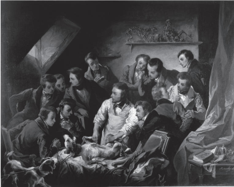
Figure 1.2 A Physiological Demonstration with the Vivisection of a Dog by Émile Édouard Mouchy, 1832.

also some evidence that the public accepts that such use should be allowed as long as it is well justified and regulated. Within the UK, a 2012 Ipsos MORI poll carried out on behalf of the Department for Business, Innovation and Skills (BIS) 39 found that 66% could accept animal experimentation so long as there is no unnecessary suffering to the animals. On the other hand, 37% of British adults objected to animal experimentation, with 21% of those polled agreeing, or tending to agree, with the proposition that the government should ban all experiments on animals for any form of research. Interestingly, 66% agreed with the statement that they accept animal experimentation as long as it was for medical research purposes, when in fact the law in the UK also permits it for the much more general purpose of advancing human knowledge. Until recently, polls carried out by MORI on this subject have tended to be reasonably constant in their findings, as well as being consistent with focus group research 40 . However, this latest poll shows a small but significant decline in public support for research using animals. It will be interesting to see how opinions move in future years.